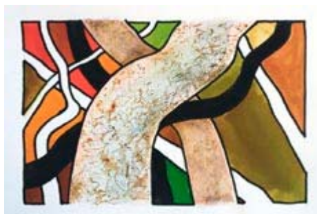
Adrian Gilbert, Forest Suite - Dominant, 30 x 21 cm, watercolour and ink on paper