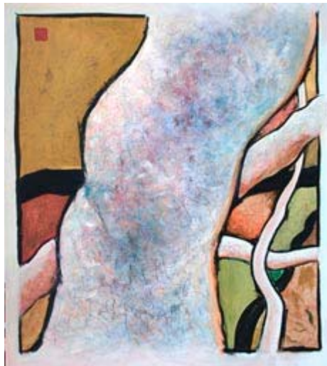
Adrian Gilbert, Forest - Tableau, acrylic and watercolour on hardboard